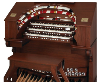
Allen LL 324QSP