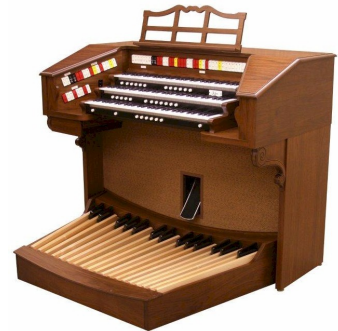
New Allen TH 300